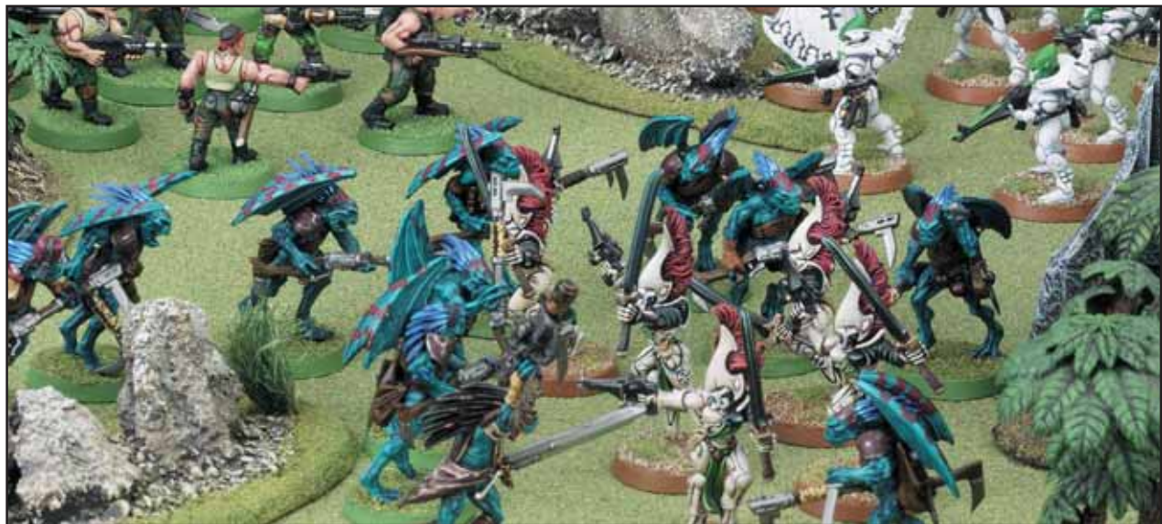
A Kroot Mercenary warband assists the Imperial Guard in staving off an Eldar assault.

Special rules: Punji traps are generally a small pit containing sharp stakes and covered with foliage. Place the small Blast marker over the model that triggered the trap so that the hole in the marker is over the model. Any models fully under the Blast marker are hit automatically, and any partially under are hit on a 4+.